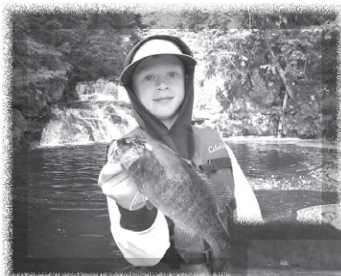
The Coghlan boys photograph their trophy fish before releasing them.

We put together our own website for one reason: We want to share our fishing experiences with our family and our friends, and other fisher kids around the world who love fishing as much as we do. Starting a website like ours was easy to do. Well, we tried a few different things, actually, but finally landed on Google's Blogger ( www.Blogger.com ), because it's easy and free. The only thing we pay for is our website address, which our Mom helped us with. It's $10 a year and comes out of our allowance. We picked the name Sick Fishing, because "sick" means "awesome," and because when people tell their boss they're sick, sometimes they might just be fishing. On our website, Mom also helped us to set up some easy Google ads, which bring in a tiny bit of money each month.